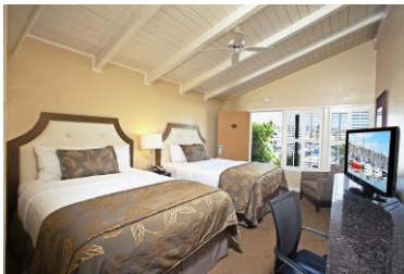
Traditional Double Marina View