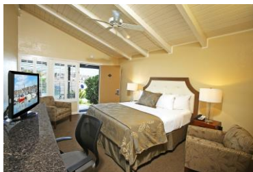
Traditional King Marina View