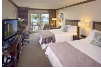
Casa Marina Double Queen