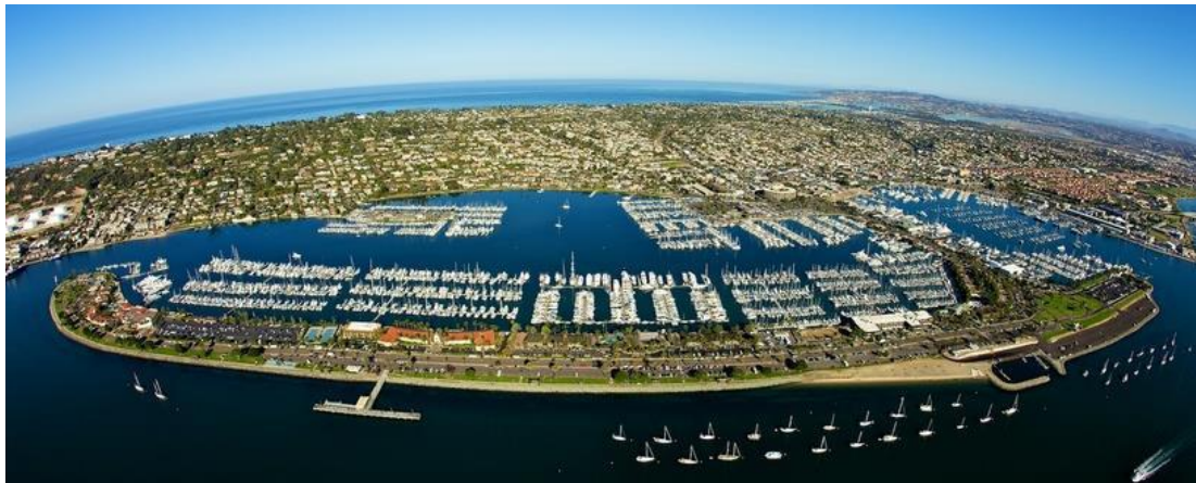
Shelter Island from above