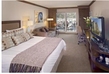
Casa Marina King