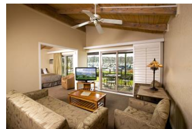
Island Palms Queen Suite